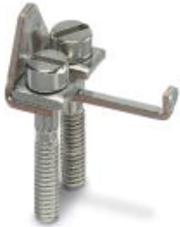
Switching jumper, pitch: 8.2 mm, number of positions: 2, color: silver

Please be informed that the data shown in this PDF Document is generated from our Online Catalog. Please find the complete data in the user's documentation. Our General Terms of Use for Downloads are valid ( http://phoenixcontact.com/download )